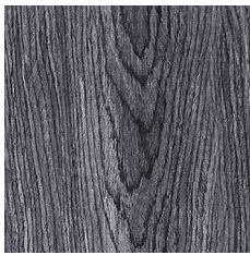
Classic Gray Oak