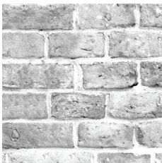
Smokey Gray Brick