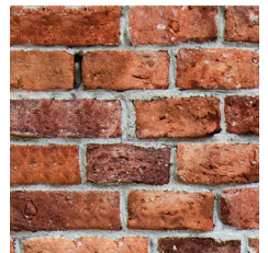
Aged Red Brick