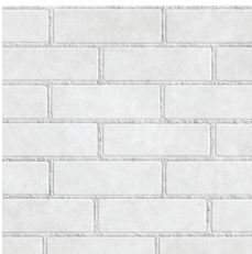
White Wash Brick