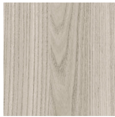
Classic Smooth Gray