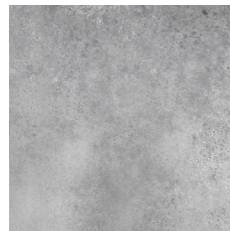
Transparent Gray Concrete